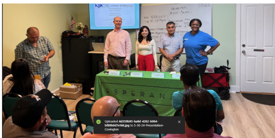
(Pictured above) On May 30, 2024, KCHR staff gave a fair housing presentation at La Esperanza Center in Covington, Kentucky.